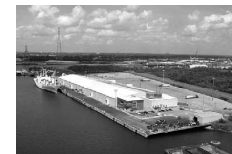
NOCS opened the new 160,000 sq. ft. dockside facility at the Jourdan Road Terminal in 2004. It was the first refrigerated dockside facility in the Port of New Orleans and also housed the company's headquarters.

At press time, World Group member, NOCS, was in the initial phases of recovery from Hurricane Katrina, while Hurricane Rita was bearing down on the Texas coastline. The company's three New Orleans warehouses and corporate offices were intact, but flooded. The exact extent of the damage and the expected date for resumption of service from the Port of New Orleans had yet to be determined. Thankfully, all 80 NOCS employees survived and were being offered jobs in Charleston, SC and LaPorte, TX, where NOCS has two additional warehouse facilities.